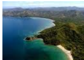
Trip for 2 to Costa Rica