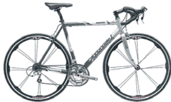
High performance Bike